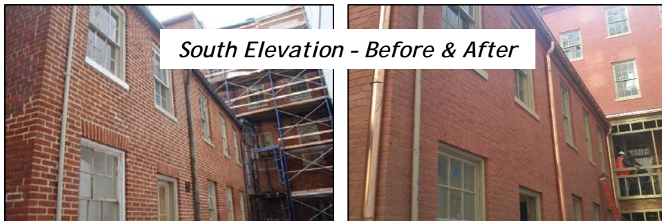
South Elevation - Before & After