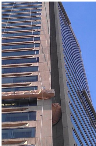
Removal of Mirror at Corner