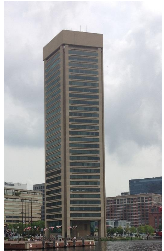
World Trade Center West Elevation

Since 1996, Contracting Specialists Incorporated has steadily emerged as a leader in specialty construction, providing clients with proven and innovative solutions for concrete restoration, masonry restoration and waterproofing. Visit www.contractingspecialists.com