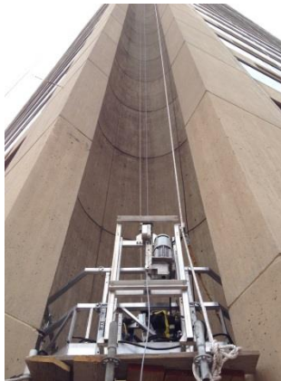
Circular Swing Platform at Corner