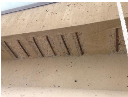
Typical Concrete Spalls